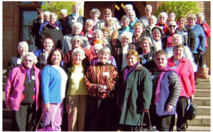
OWN NSW Conference 2007

Beth is at present drawing up a list of the many duties needed to be done by volunteers. This will enable the Management Team to encourage OWN volunteers to promote the aims of OWN and to keep the organization viable. At the moment the greater part of the work falls on a few willing shoulders – we need a great deal more help in order to maintain our energy and State profile. We will