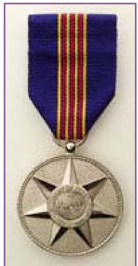
Australian Centenary Medal, 2001